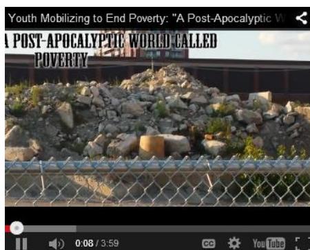
Image of a youth poster and a video from a series of posters and videos, created through the Youth Mobilizing to End Poverty project

Family Service Toronto & Campaign 2000 worked with a group of energetic and creative youth volunteers from Toronto and surrounding areas aged 13-24 in creating both digital short videos and posters that highlight the need to end Child and Family Poverty in Canada. Youth voices are important to consider when you cast your vote in the October federal election.